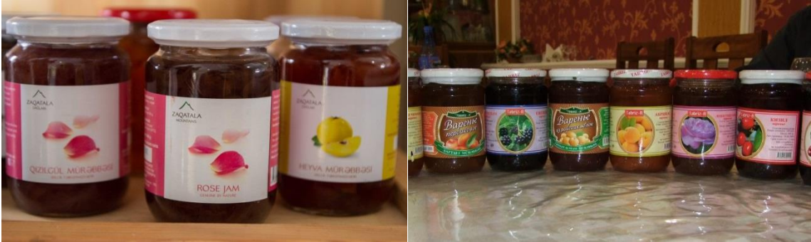
Figure 2: Packaging of jams and muraba after (left) and before (right) support by SMBP.

The logistics of marketing were also supported with regard to selection and import of packaging materials and the training and designation of a sales manager based in Baku. Lastly, GIZ supported Eko-Zaqatala test sales by covering stall fees in three supermarkets for a trial period from 2012 to 2013.