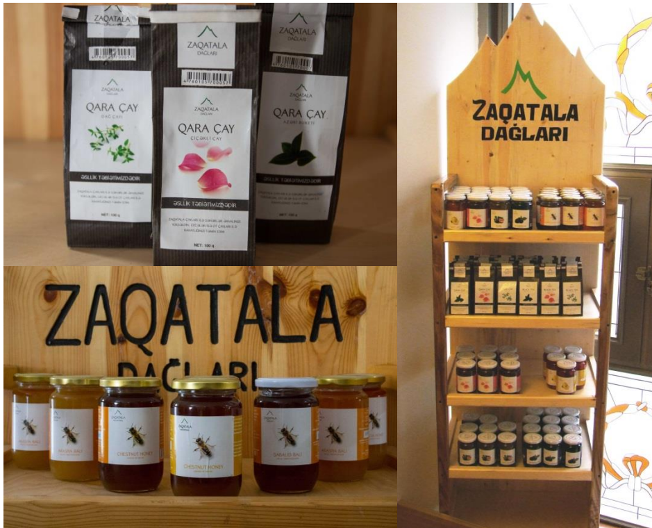
Figure 3: Packaging of Eko-Zaqatala teas and honey, and stall for presentation in supermarkets.