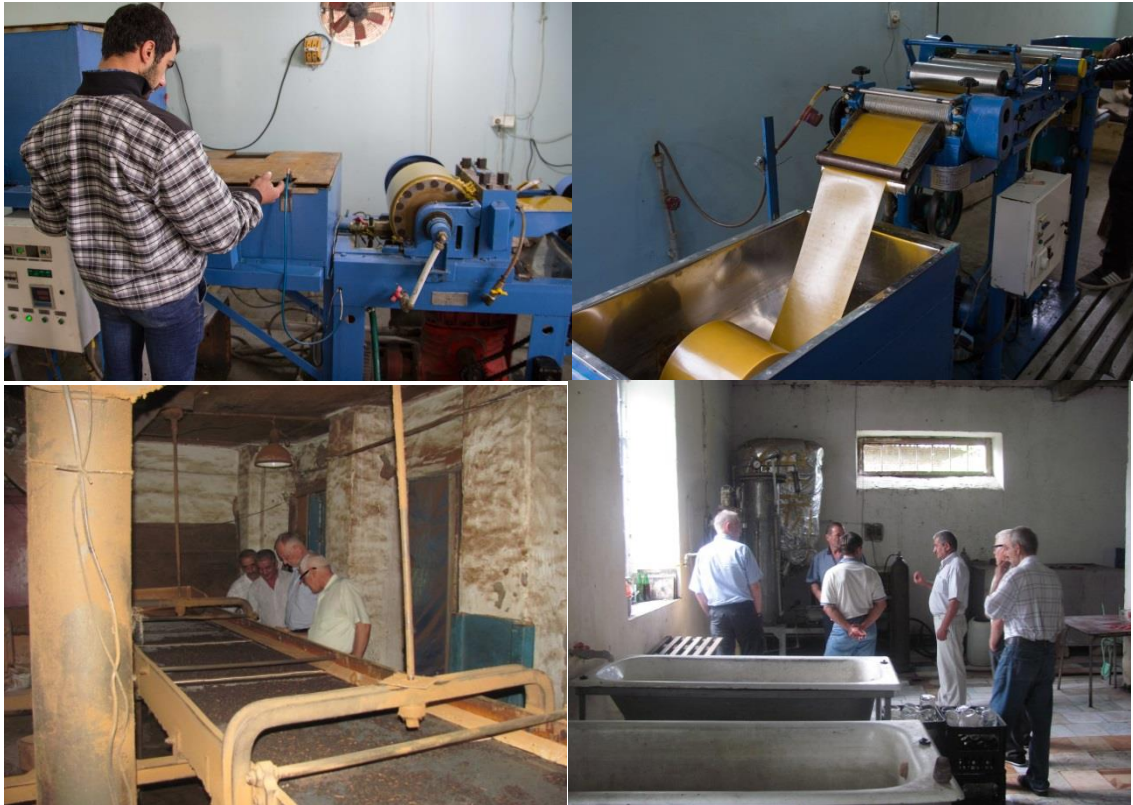
Figure 1: Eko-Zaqatala production facilities after (top; honey) and before (bottom; tea and jam) support by SMBP.

Trainings on the HACCP 3 standard on food hygiene and the FairWild Standard on ecologically sustainable and social wild collection were conducted, and an internal control system was introduced for quality management according to the standard ISO 9001 4 . In order to sell in supermarkets, a health and hygiene certificate from the Ministry of Health and a production license are required. While the training offered by GIZ-SMBP is not a guarantor for obtaining such certificates due to opaque awarding procedures, it can be considered helpful.